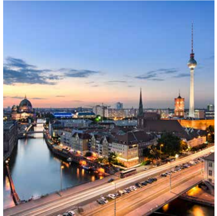
Berlin: the capital of Germany