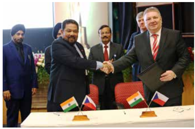
MOU Signing between EEPC India and BVV fairs which organizes MSV 2017 – March 2017

EEPC India signed an MoU with BVV Fairs, the MSV Brno organisers, to manage the India Pavilion at the 59th edition of the International Engineering Trade Fair (MSV) to be held during 9-13 October, 2017, in Brno, Czech Republic. More than 100 Indian companies are expected to participate at the event and India is the Partner Country this year.