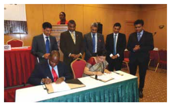
MOU Signing between EEPC India and BVV fairs which organizes MSV 2017 – March 2017

The MoU was signed between EEPC India and the Mozambique Chamber of Commerce during BSM in South African countries.