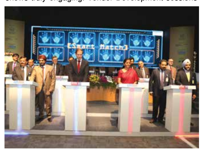
The Smart Match !!- IESS VI is inaugurated

The Global Sourcing Meet key stakeholders – Yanmar, Kubota, Siemens and Schwing Stetter – made their shows truly engaging. Vendor Development sessions